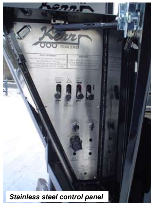
Stainless steel control panel